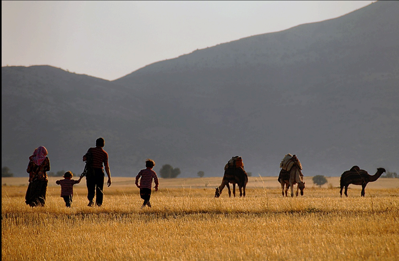
The Last Nomads: Sarıkeçililer