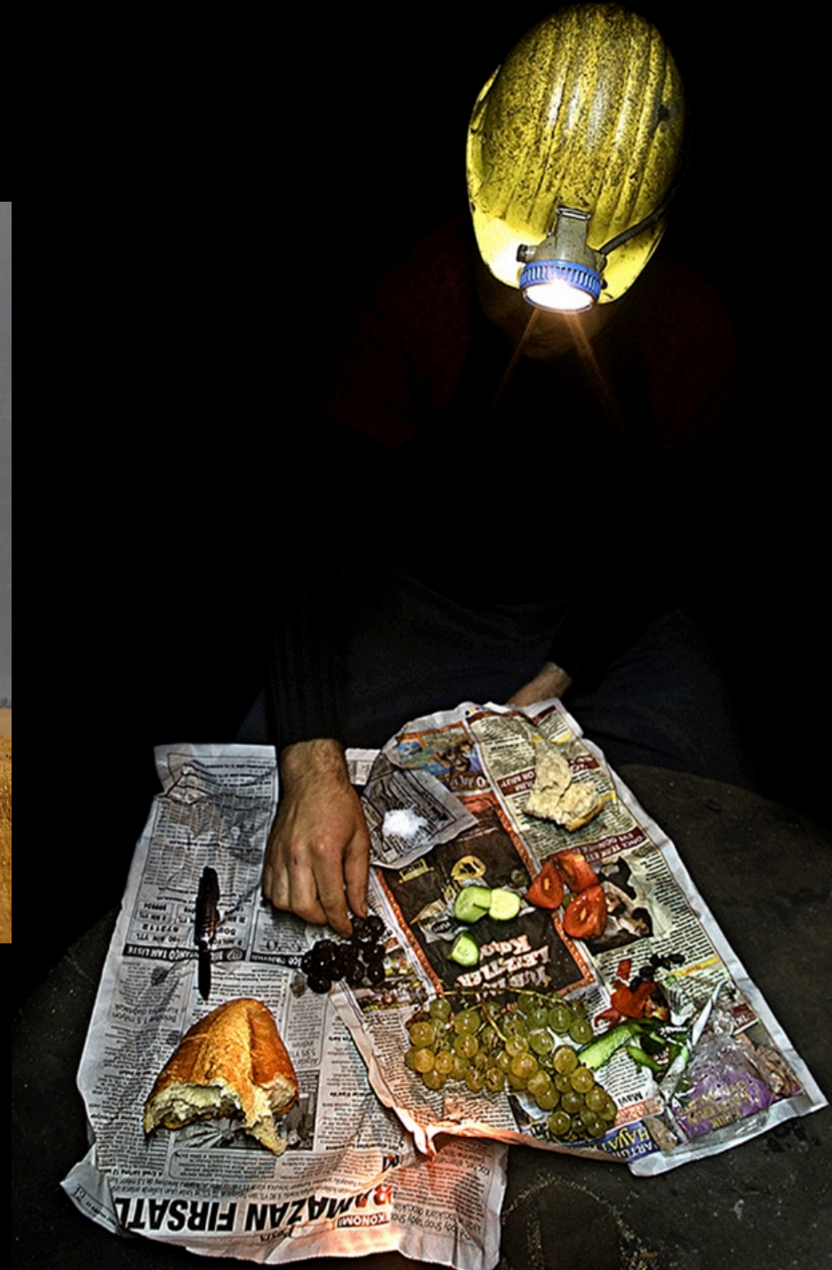
Altitude-750 – The Mine Workers